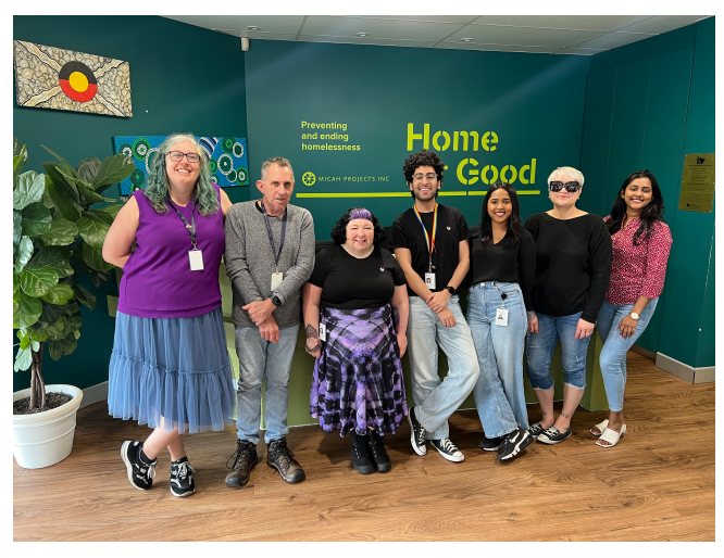
Home for Good Hub team

Further analysis revealed the following nuances regarding leadership positions in 2023: